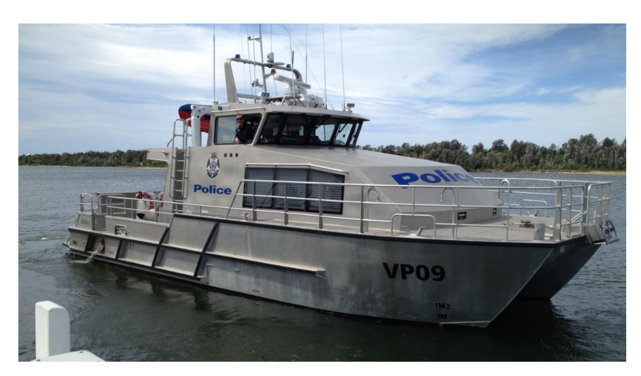
Gippsland Water Police Vessel "Defiance" - VP09

Application for Arrival and Departure – Port of Corner Inlet and Port Albert Application for Arrival and Departure – Port of Gippsland Lakes Wharfage Certificate and Cargo Declaration Vessel Maintenance on Water Application