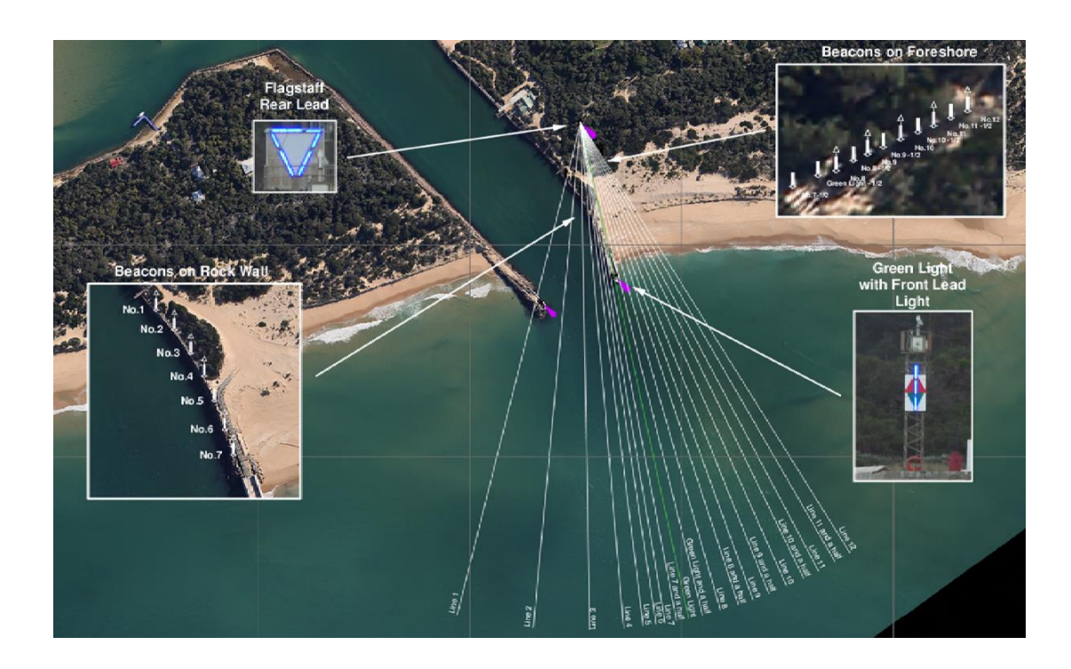
The photo above illustrates the characteristics of the "Flagstaff Rear Lead" triangular blue LED light apex down, and the "Green Light Front Lead" vertical bar LED light. The Green Line indicates the line of approach with the "Leads in Line". The Leading lights are available day and night.