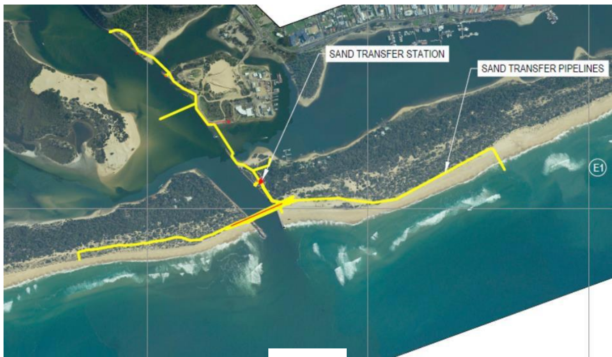
Figure 6: Layout of the Sand Transfer System