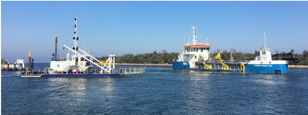
Figure 2: Kalimna CSD and Tommy Norton TSHD operating in the Inner Channels

With two outfalls, and depending on prevailing weather, sand can be pumped in either direction that assists in its dispersal and reduces the amount that moves back into the entrance channel.