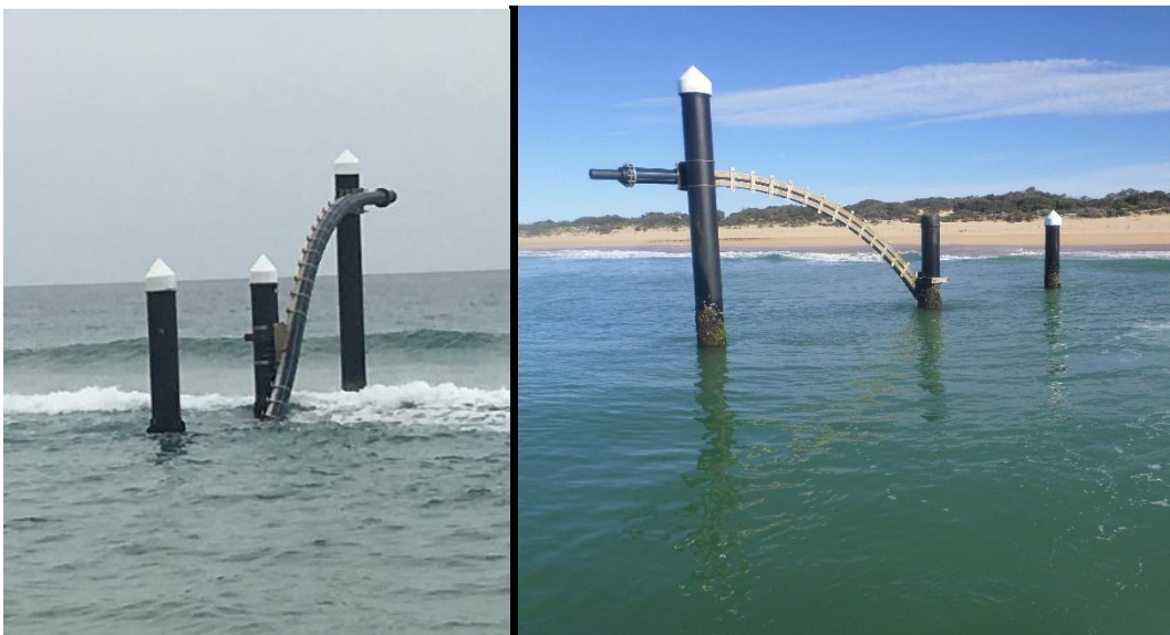
Figure 7: East outfall