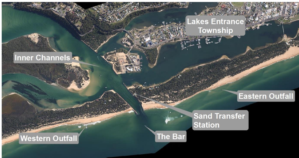
Figure 1: Location of elements of the entrance and sand management activities.

A permanent entrance ( the Entrance ) to the port of Gippsland Lakes from Bass Strait was completed in 1889. Since its construction, there has been continual ingress of oceanic sand into the Inner Channels. In addition, an offshore bar ( the Bar ) has formed outside the Entrance (refer Figure 1). This sand on the Bar creates navigation hazards requiring almost continual maintenance dredging. Safe access cannot always be assured.