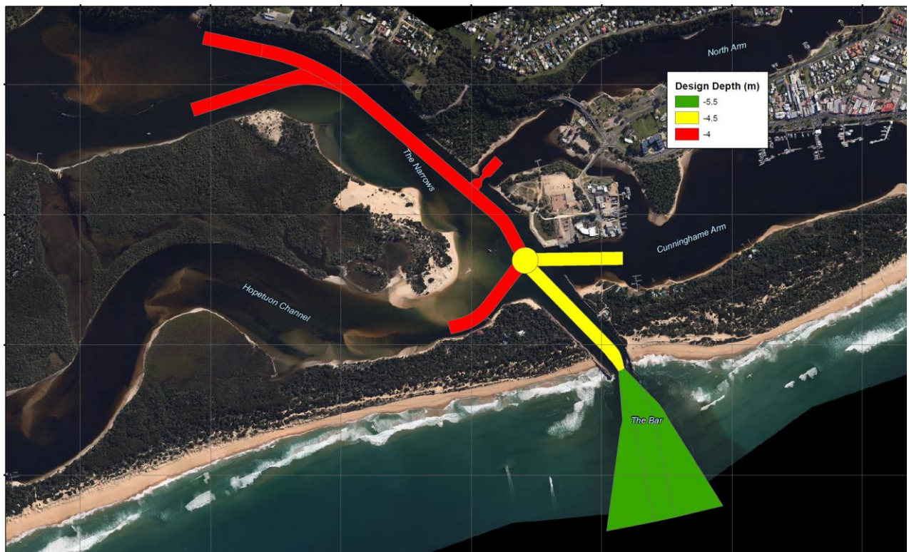
Figure 4: Dredging areas