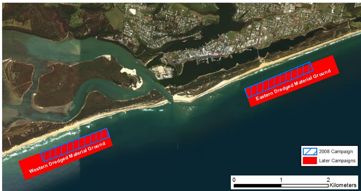
Figure 5: Dredged Material Grounds

Each DMG comprises a rectangle of dimensions 2,000m long by 400m wide as illustrated below: