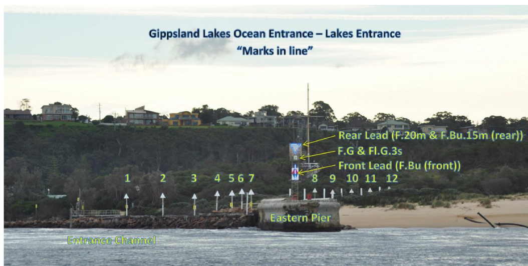
The photo above is taken from seaward of the Entrance and illustrates the “Leads in Line” when the “front Lead” is located on the “Green Light”